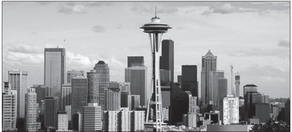
College Broadcasters, Inc. travels to Seattle for the third annual National Student Electronic Media Convention Oct. 23-25 at the Renaissance Seattle Hotel. Seattle skyline from Queen Anne Hill

Another special feature this convention is the return of the Next Generation Radio project. Beginning Oct. 20, six student journalists will have the opportunity to complete a full-scale multimedia-training project with an emphasis on radio storytelling. Each student accepted to this project will be paired with a professional journalist and spend the week working together on a character-driven multimedia story. There is no fee to attend the Next Generation Radio Project. Interested students must ap-